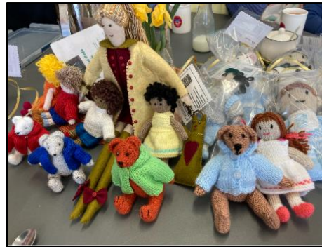
KNACC Group All welcome