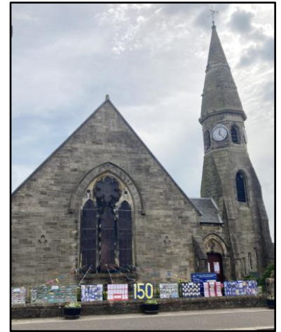
Christine and friends beautifully decorated our Church garden - Celebrating 150 years of Forth St Paul's.