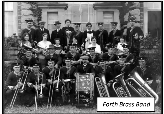
Forth Brass Band