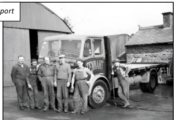
This year marked 125 years in transport for Tennant of Forth

Thank you to Forth Memories for allowing us to use some of their photos for this newsletter.