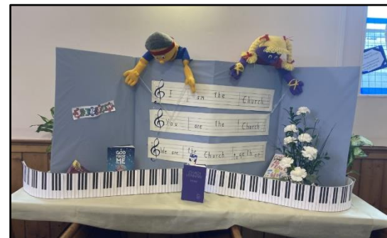
The beautiful displays