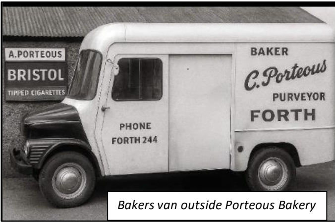
Bakers van outside Porteous Bakery