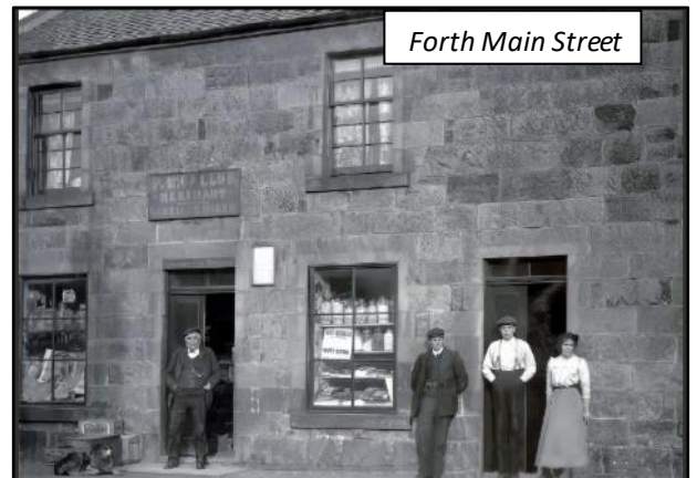
Forth Main Street