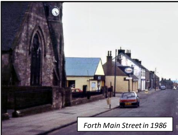
Forth Main Street in 1986