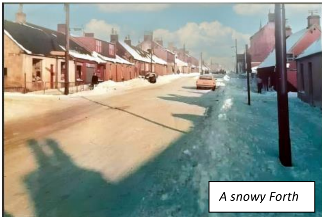
A snowy Forth