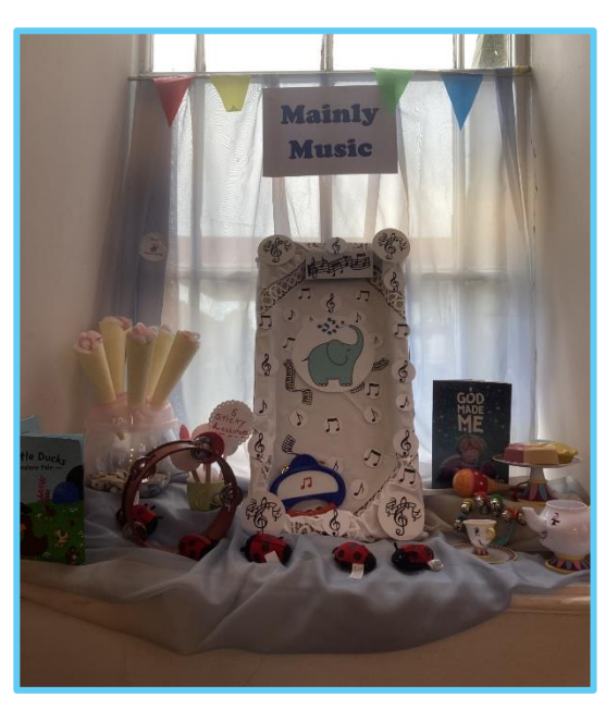
Why not pay us a visit on a Tuesday morning from 10.00 am to 11.30am in the large Church Hall and see the fun and joy we have.

There is a sense of belonging with Mainly Music which I am sure everyone would agree with, and I think it goes some way to addressing the issue of loneliness at a time when there are fears it will be the next public health issue.